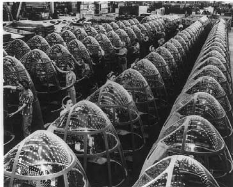
Top: Women aircraft workers finish bomber noses at the Douglas Aircraft Co. (1942) ; Right: Good Work Sister: poster (1943)

People worked very hard and worried about friends and loved ones during the war. Many sought escape in popular culture, particularly in films and radio. Popular entertainment steered away from the subject of war and toward light entertainment as a diversion from the horrors of war. Harvey was one such distraction.