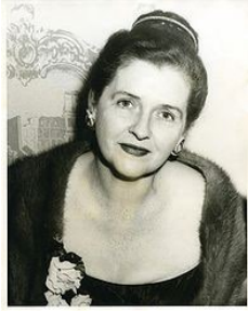
MARY COYLE CHASE